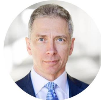
Andrei Iancu Director, United States Patent and Trademark Office Biography