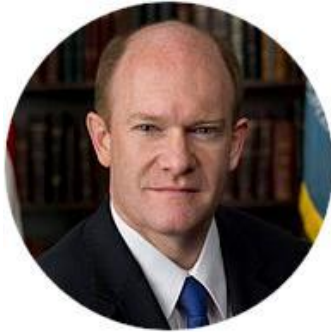
Christopher Coons United States Senator Delaware Biography